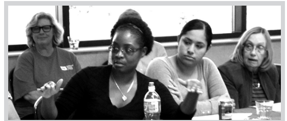
Above: El Paso nurses discuss the issues;

After marching in the massive MLK parade, nurses met over two days to discuss and take action on several key issues.