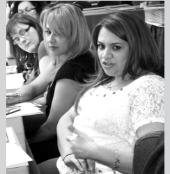
Below: Texas RNs get reports from around the state