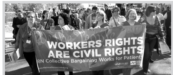
RNs marching in MLK Day parade